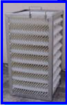
VELCON PLATE PACK ASSEMBLY